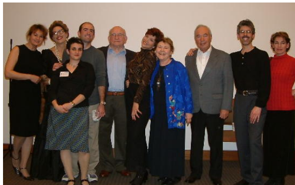
Ed Asner and the cast of "Mentshn"

The rich learning experiences offered by CIYCL inspire and empower individuals to become the activists, educators, artists, and writers who are needed to ensure that the Yiddish language survives and continues to be renewed.